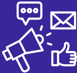
Communications and Marketing