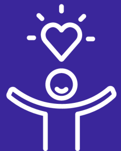
Staff Support and Well-being