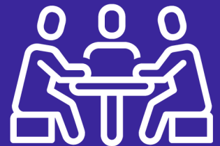
Becoming a Trustee